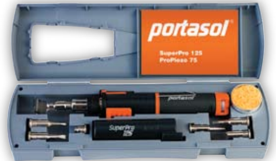
plus 11 assorted spare tips available

Kit includes 7 tips: Hot air for Heat Shrink, Torch, Hot knife and 4 soldering tips accessories included are sponge and tray, kit box, stand and instruction.