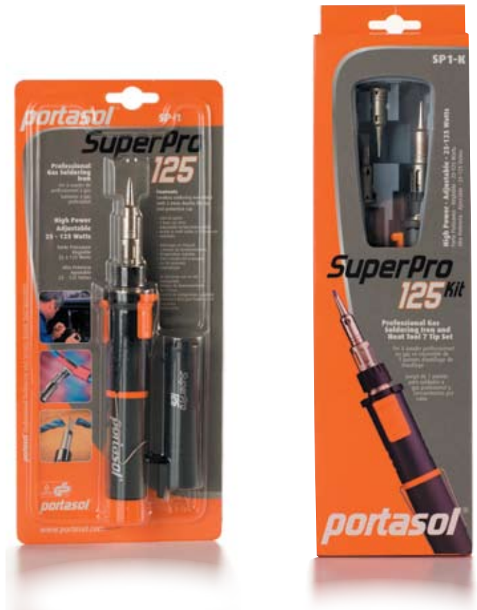
11 assorted spare tips available